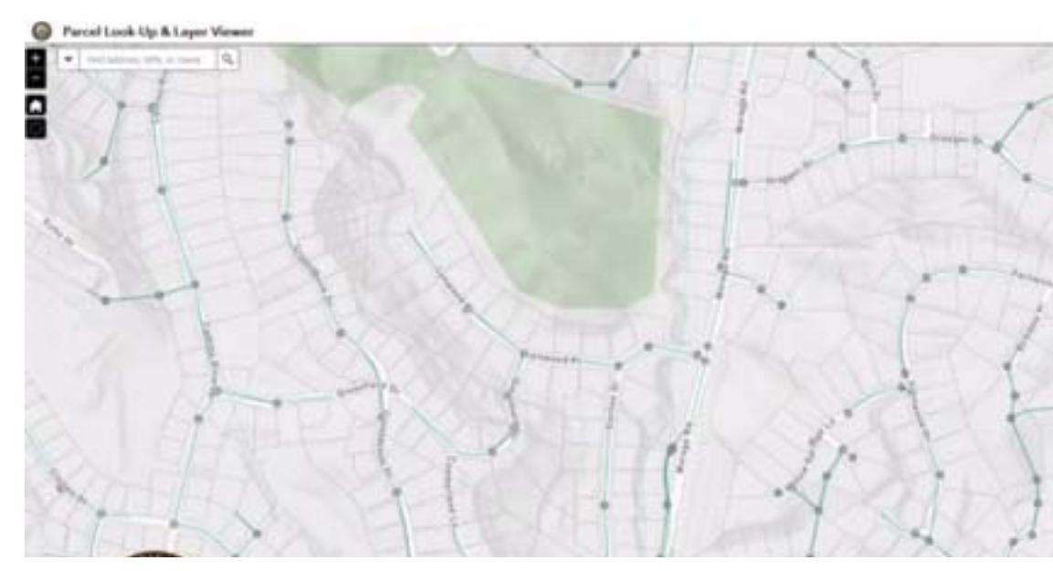
Example of GIS Storm Drain mapping and manhole covers for use by public works